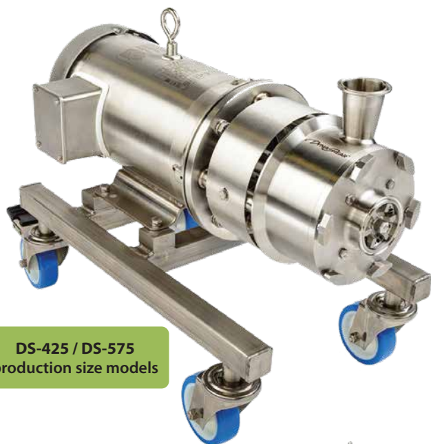
DS-425 / DS-575 production size models

The DynaShear represents the latest technology for sanitary inline continuous processing, or batch processing with recirculation. The DynaShear will blend, dissolve, deagglomerate, disperse, and emulsify a wide range of fluids and semifluids, and is particularly effective for wetting out powders into a liquid. It features a first-in-class tandem head design combining the benefits of both an axial and a radial stage, creating excellent shear and flow characteristics. The result is droplet size reduction as low as 2 - 3 microns and a very narrow distribution, plus flow capacities that are substantially higher than existing inline mixers.