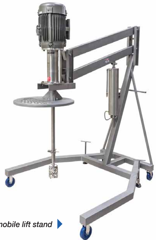
Pneumatic mobile lift stand ▶

Lifting Operation Options: The pneumatic lifting operation feature offers greater labor and time savings and provides a smooth lifting motion for various batch sizes. A manual hydraulic style is offered as well.