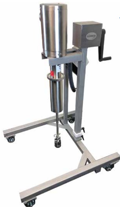
◀ Pilot Mixer lift stand